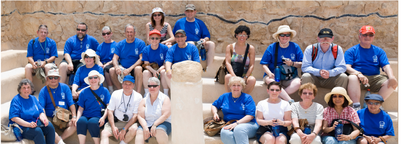
Our visit to Jerusalem synagogue during the trip to Israel